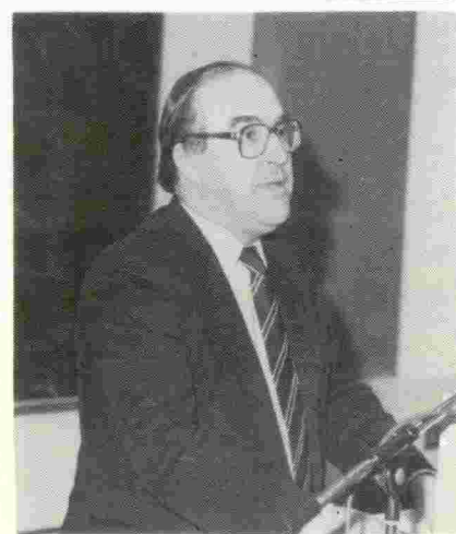
Opposition Front Bench Spokesman on Trade and Industry, Mr. John Smith, MP, who visited the University earlier this month to give a SPRU seminar entitled "Strategy for Recovery". The seminar, which was so well attended that it had to be moved to a larger venue, gained wide coverage in the national and local press.