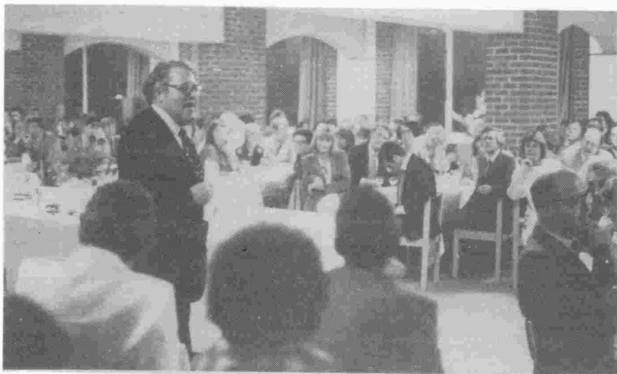
Asa Briggs addressing a packed meeting in the Refectory. A flashback to the mid-70s? No, it's Lord Briggs in characteristic pose as he conjured up memories of the University's beginnings at the 'early years' reunion dinner held during the summer. A report of this event and of the opening ceremony for the Aisin Seiki building (pictured bottom right) is given on page 4.