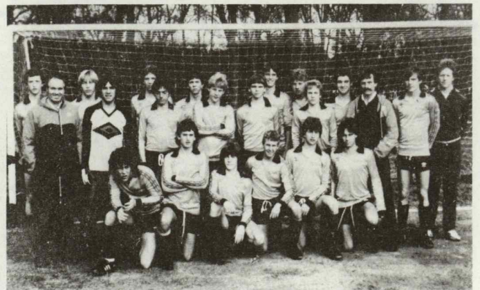
The University played host for two weeks over Easter to the Umbro Select Soccer Team from the USA. The tour was part of a sponsored programme aimed at developing youth soccer with a view to the USA hosting the World Cup Finals in either 1986 or 1990. The squad, pictured above before their final game at Burgess Hill F.C., stayed and trained at the Isle of Thorns. They played six matches against local youth sides, winning four matches and suffering only two narrow defeats at the hands of Shoreham and Burgess Hill.