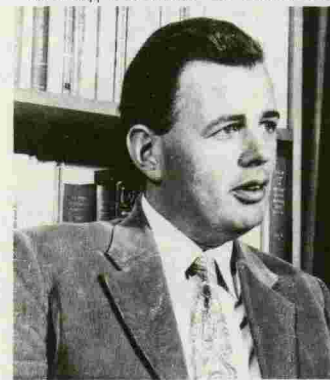
Professor John Kingman

Professor John Kingman, FRS, Chairman of the Science and Engineering Research Council, local resident and Visiting Professor of Statistics.