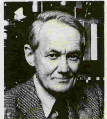
Professor Kai Siegbahn

Professor Kai Siegbahn, Nobel Laureate and Professor of Physics at the University of Uppsala.