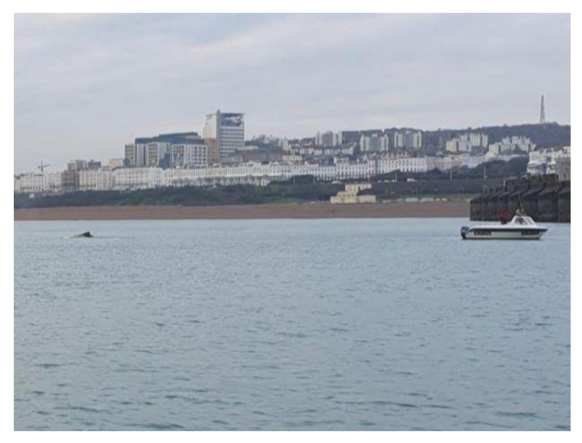
Click image to view footage of a humpback whale sighted off Brighton Marina on 5 December.