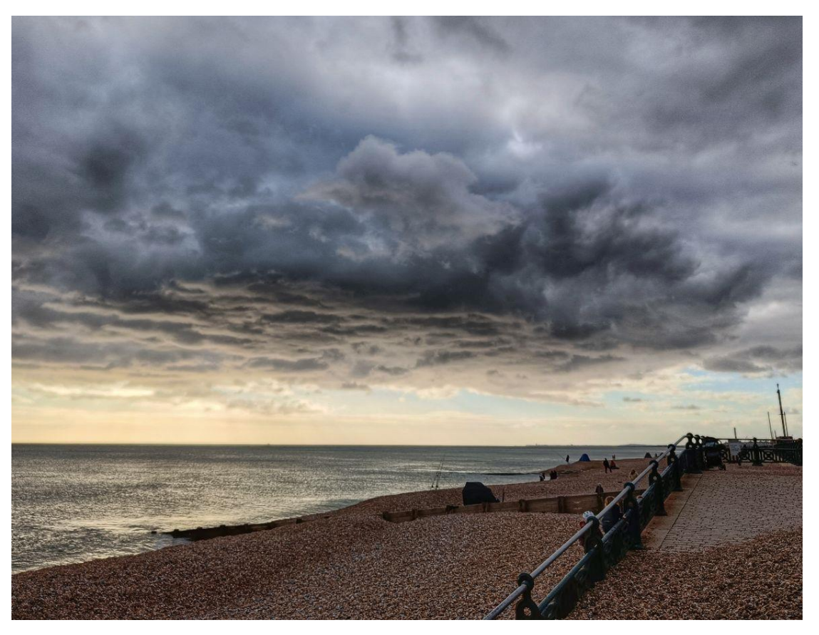
Hove, looking ominous