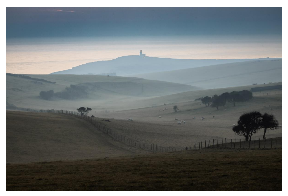
On the South Downs with Belle Tout Lighthouse in the far distance.