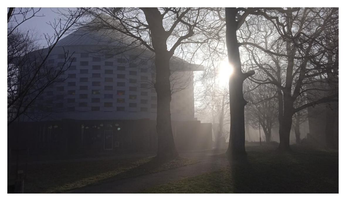
Mist at Sussex campus on Valentine's Day