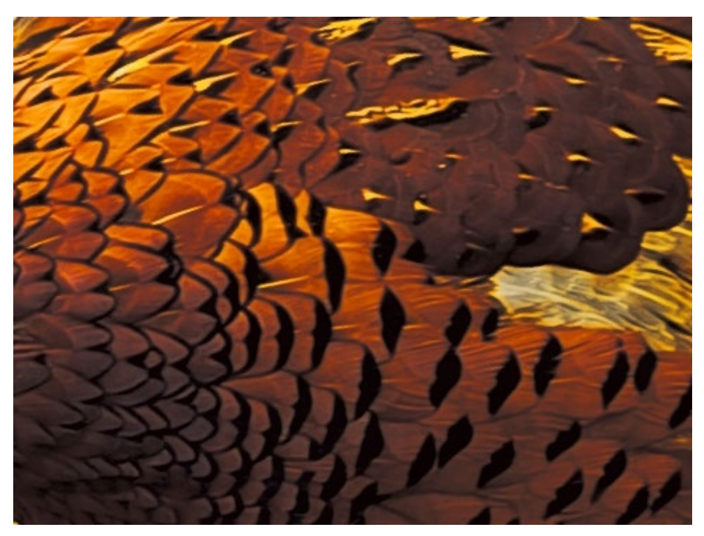
Bronze plumage of a cock pheasant