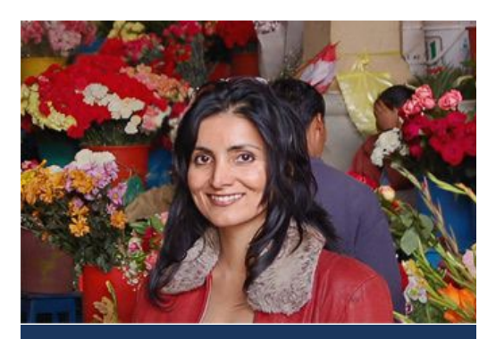
Global Studies Professor shortlisted for the prestigious Asian Women of Achievement Awards