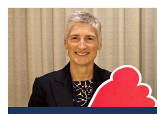
BSMS Professor shortlisted for Commonwealth Short Story Prize