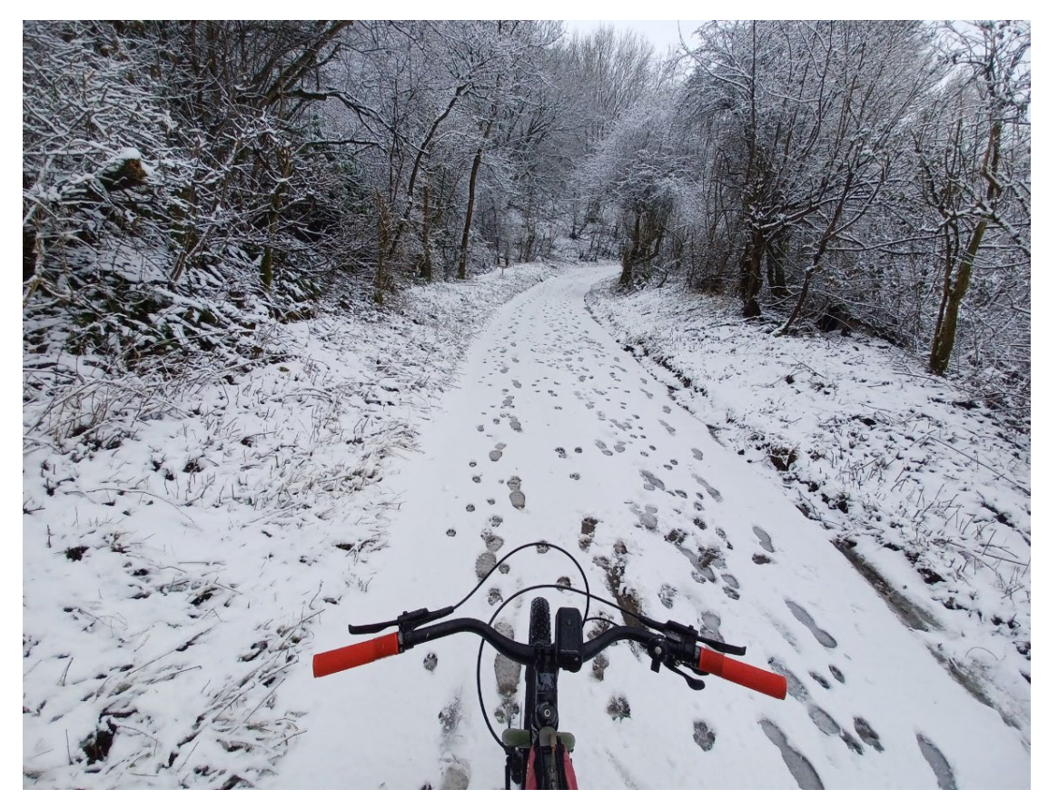
Morning commute through Woods Mill nature reserve, Henfield