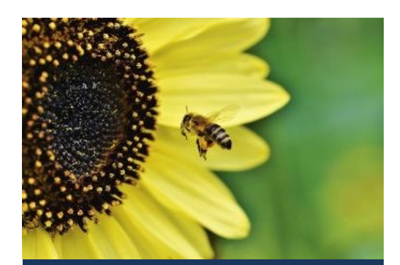
Research with Impact <u>Five University of Sussex</u> <u>academics among top 1% of most</u> <u>cited researchers in the world</u>

Student Experience <u>Sussex Student Centre shortlisted</u> <u>for prestigious FX International</u> <u>Interior Design Award</u>