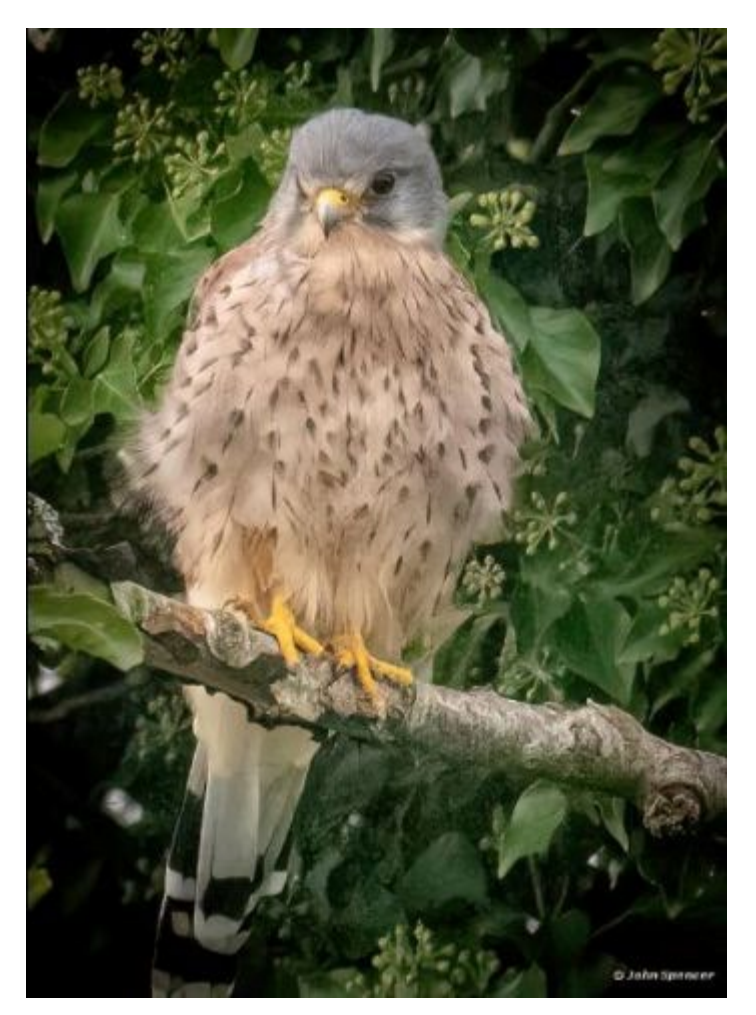
Young kestrel at Barcombe Mills