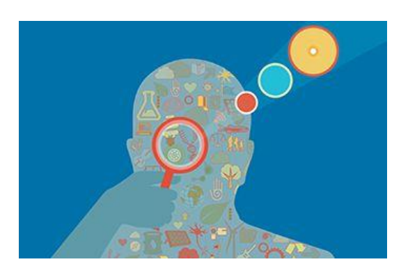
Nominations open for Research Culture Awards

Sussex contributes £495 million each year to the UK economy and brings benefits to our local region outlined in our latest Economic Impact Report.