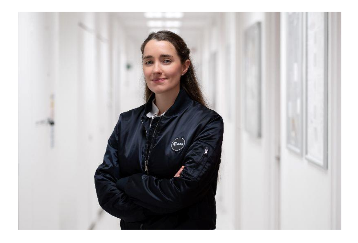
Sussex alumna prepares to become the UK's first ever female astronaut