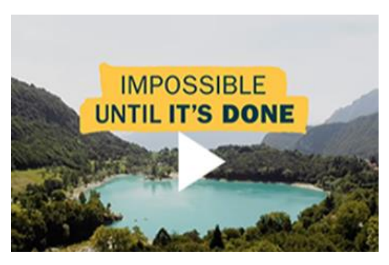
Video: Research at Sussex

Our Parliamentary reception on Tuesday 11 July welcomed politicians and policy makers including Government ministers, MPs and peers.