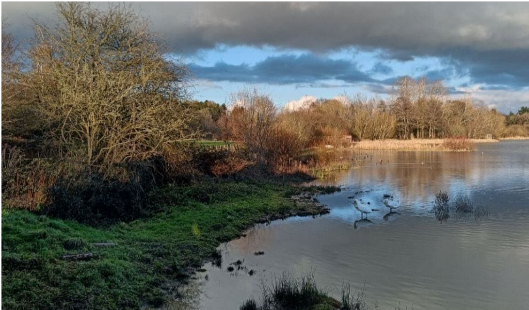
Warnham local nature reserve, Horsham