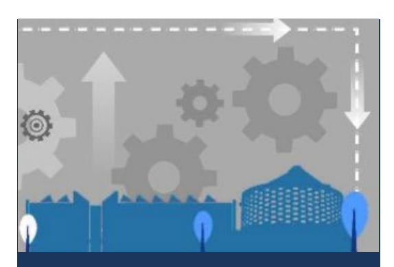
Research with Impact Register now for 8 February Policy@Sussex showcase