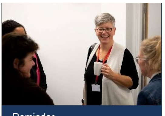
Reminder Still time to book for the 7 February VC Open Forum