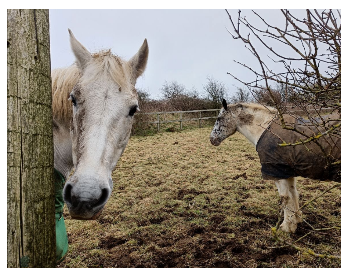
Horses sheltering from the wind near the <u>Jack and Jill windmills</u> near Clayton