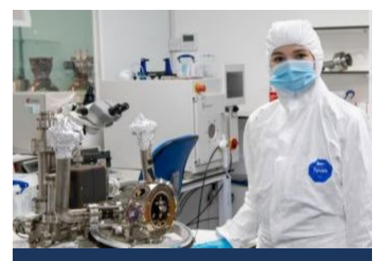
Creating a better campus Supporting better research with a new Research Management System