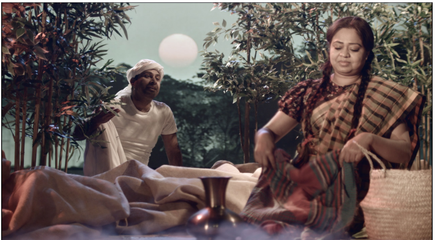
Lalon - Heart of Madness

Full details can be found at https://bit.ly/sussexethics .