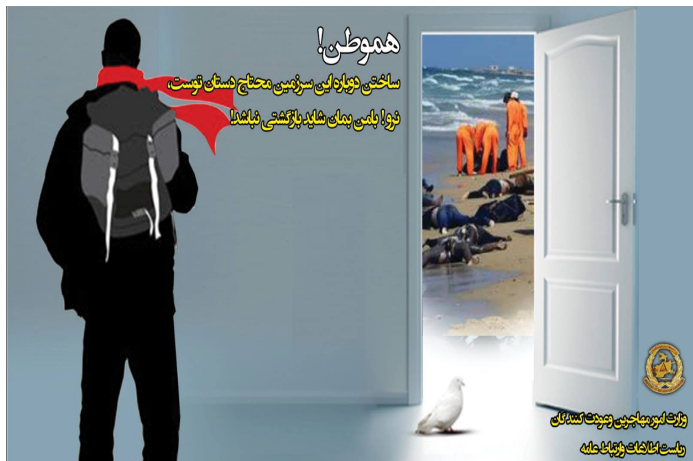
Figure 2. A poster shared on social media by the Afghan Ministry of Refugees and Repatriation, warning their 'compatriot' of the potential risks of migration, and pointing out starkly that there may be no return

The timing of the Afghan Ministry's campaign – coinciding with the German campaign – is noteworthy. It is well known that the Afghan government is highly reliant on donor countries for its administration, services and security. It would be interesting to know whether or not the campaigns were intentionally coordinated.