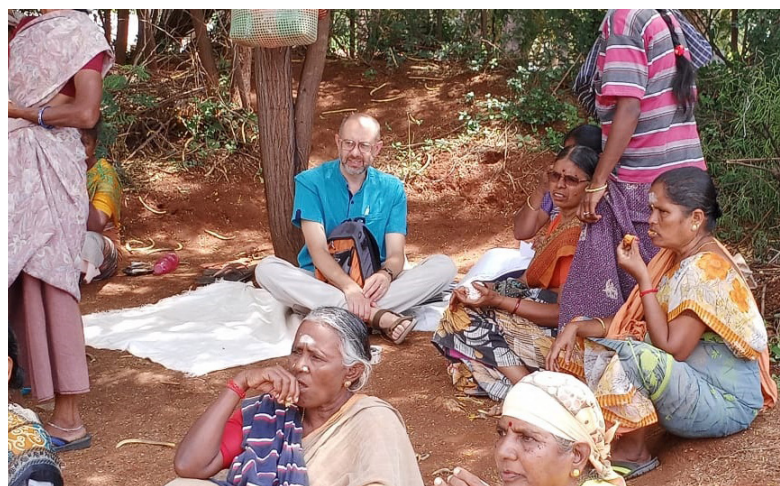
Observing an NREGA work site in Tamil Nadu, September 2019