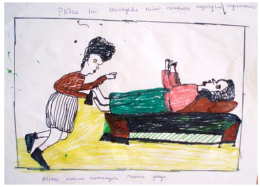
Figure 1: 'This picture shows me caring for my mum when she was ill', drawing by Neema (aged 18) who cares for her mother with HIV and three younger siblings.