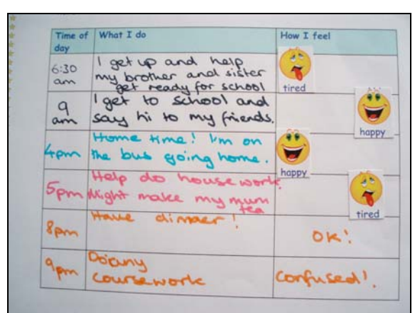
Figure 2: 'A typical day' diary page completed by a young carer as part of the life story book

to explain their photographs and were given a copy to keep. Participatory methods helped children to talk about their caring responsibilities and sometimes painful, life experiences, as well as sometimes providing a distraction if a child became upset during the interview.