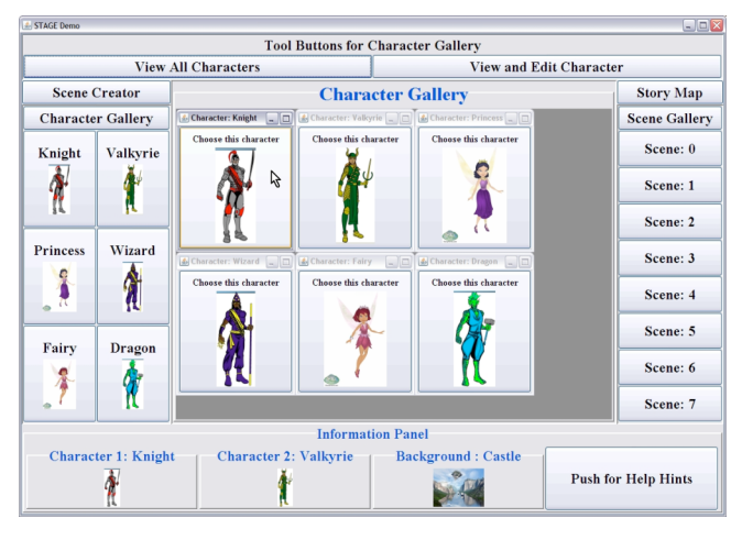
Figure 3. The STAGE interface

application. The user starts by choosing a character (as shown in Figure 3), a background, and then launches the Magic Mirror by clicking on the appropriate button.