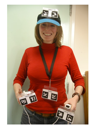
Figure 2. User wearing Augmented Reality Tags

Interaction with the prototype takes place via a Wii Remote, which is used as a mouse and pointing device. This device is detected using a Wii sensor bar mounted on the screen. Finally, the prototype uses Augmented Reality (AR) which allows virtual objects to appear alongside real world objects in a video display. The AR system used is described in [6] and [7], whilst [1] and [2] give a wider background on AR research. The prototype requires either a video camera or a web cam (as in Figure 1), along with AR marker tags which are worn on the user's head, body and hands (see Figure 2).