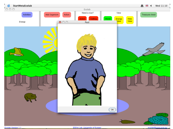
Fig. 1 An explicit more-able partner for the M-Ecolab

While Ada completes actions in the M-Ecolab, the system updates its three learner models: cognitive, meta-cognitive and motivational. These models consist of beliefs about how much she understands eating relationships, how much it believes she understands her own learning needs related to help-seeking, and also how much it believes she needs affective feedback. This information is used to adjust the affective post-activity feedback provided by the system according to the perceived degree of motivation, and to select the appropriate motivational trait that will be supported [13], prompting the character to alter his voice tone and gestures accordingly.