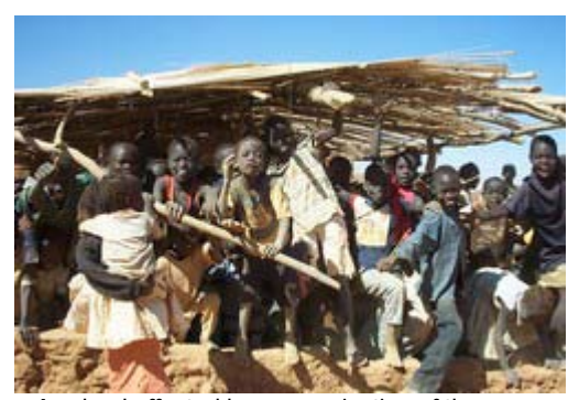
A school affected by reorganisation of the camp

pupils from 1st to 4th grade 500 SD and from 5th to 8th grade 700 SD and 100 SD to collect the exam certificate. Additionally, children have to pay 20 SD per day.