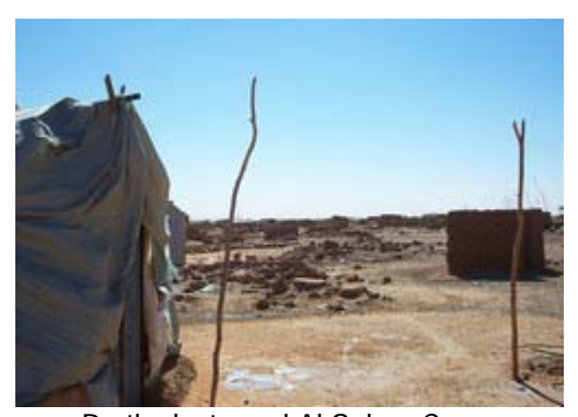
Partly destroyed Al Salam Camp

Another concern of inhabitants is the recent increase in crime. Proximity of the camp to Souk Libya encourages many to visit the camp in order to indulge in illicit activities such as drinking and prostitution. Incidents of violence increased during the process of camp planning. The leader of one popular committee in the camp says: 'In an incident of armed mugging that occurred two months ago, a local inhabitant was attacked with a knife in order to take his money. Pulled down fences enable thieves to have easy access to homes; empty plots hinder any rescue effort by others.' It is ironic that the process of organizing the habitat for IDPs, which was meant to allow for a better provision of services, resulted in the deterioration of existing services, led to the destruction of homes, and increased the rate of crime in the area. Our interviews and conversations with grassroots bodies and local civil society organizations, however, revealed that the authorities work with and consult local leaders in the different matters related to the camp. But as we will show below, the youth in Al Salam camp contest traditional leaders who are accused of complicity with the authorities.