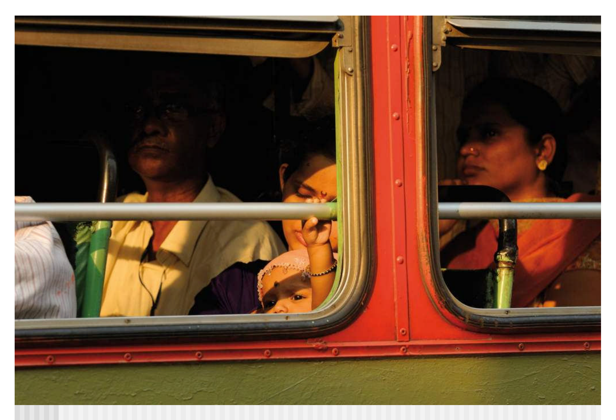
Migration 'pub quiz'