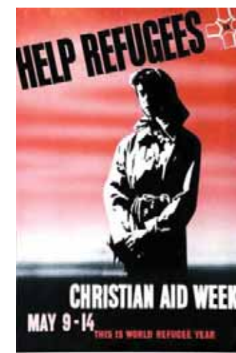
Christian Aid Week poster 1959

In this, its golden jubilee year, the UK's longest running door-to-door fundraising week is expected to raise £15.5 million.